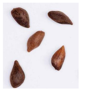
Seeds of P. abies

The site of island at Spitsbergen was selected for storage as it is free from the tectonic activity zone and it possesses the permafrost facility which eases the process of preservation. The vault at present stores about 840000 seed varieties, exclusively of food crops. For the first time in history, the frozen depository has accepted a delivery of forest tree seeds. The two tree seeds to embark the repository are the Norway spruce ( Picea abies ) and Scots pine ( Pinus sylvestris ). The seeds of both the tree species were collected from the natural forests in Finland and Norway.