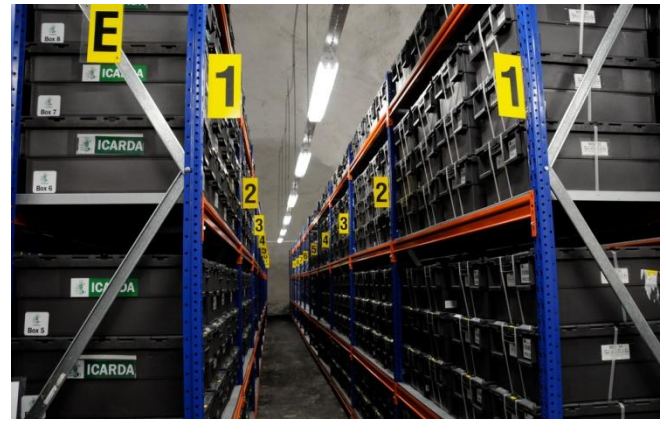
Storage racks inside the vault

They formed the first consignment of tree seeds for the vault from a consortium of organisations across the Nordic nations. The species were selected because the trees play an important role, economically, ecologically and socially. Researchers mainly hope that the tree seed samples will help monitor long-term genetic changes in natural forests. "The possibility to have seed samples stored in the vault is a great opportunity to complement our forest tree gene conservation, which is based on in situ gene reserve forests," explained Mari Rusanen, a researcher for Natural Resources Institute Finland (Luke), one of the organisations involved in the seed collection.